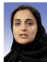
Sheikha Lubna bint Khalid Al Qasimi Minister of Foreign Trade United Arab Emirates