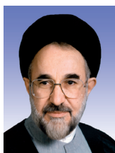
Seyed Mohammad Khatami Former President Islamic Republic of Iran