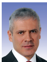
Boris Tadic President Republic of Serbia