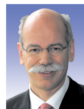
Dieter Zetsche Daimler AG