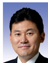
Hiroshi Mikitani Rakuten Inc.