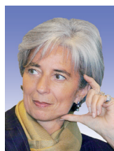
Christine Lagarde Minister for Economy, Industry and Employment of France