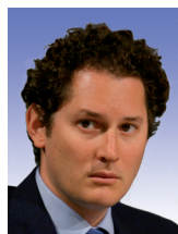
John Elkann Fiat S.p.A.