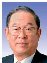
Fujio Cho Toyota Motor Corporation