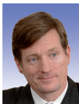
Brady W. Dougan Credit Suisse