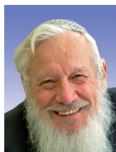
Robert John Aumann The Hebrew University of Jerusalem