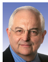
Martin Wolf The Financial Times