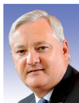
Peter R. Voser Royal Dutch Shell plc.