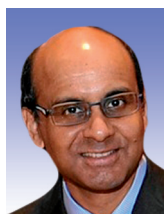
Tharman Shanmugaratnam Minister for Finance Singapore