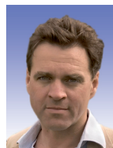
Niall Ferguson Harvard University